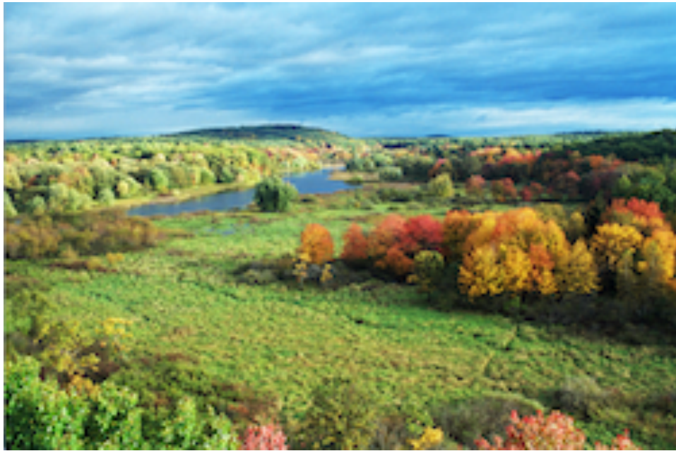
September 24, 2003—Riparian Autumn (early)