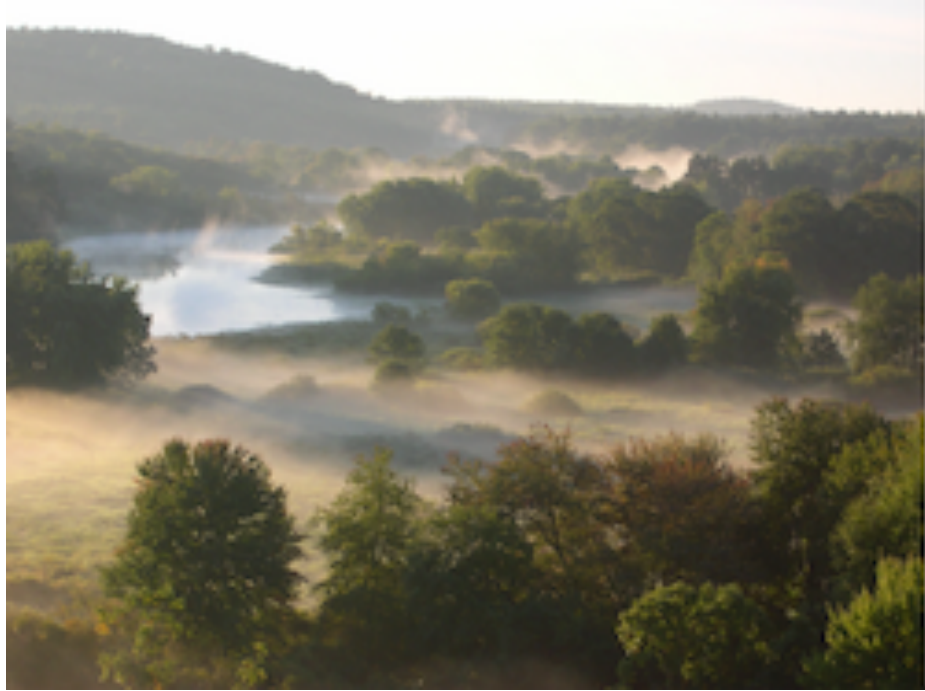
August 3, 2008—Summer (fog)