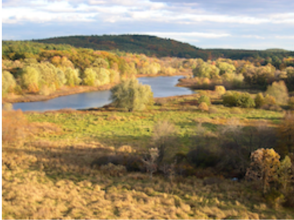
October 24, 2003—Riparian Autumn (late)