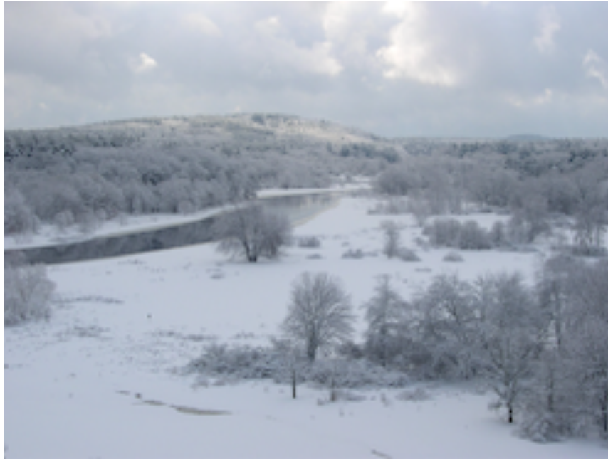
March 13, 2005—Aquatic Spring (snow)