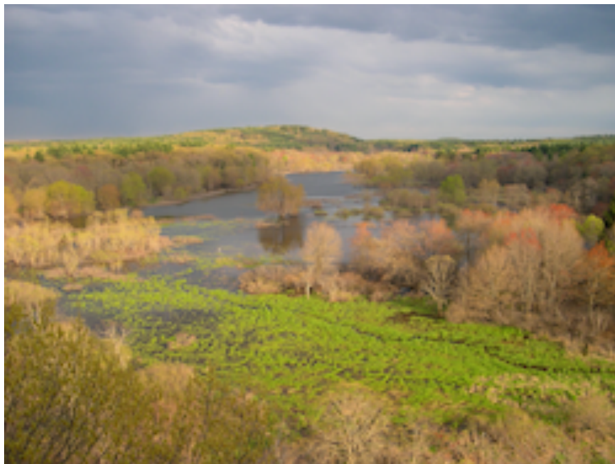
May 4, 2005—Riparian Spring