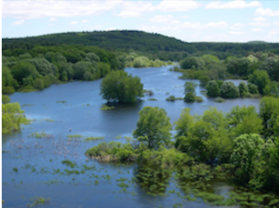
June 11, 2006—Inland Sea (flood)