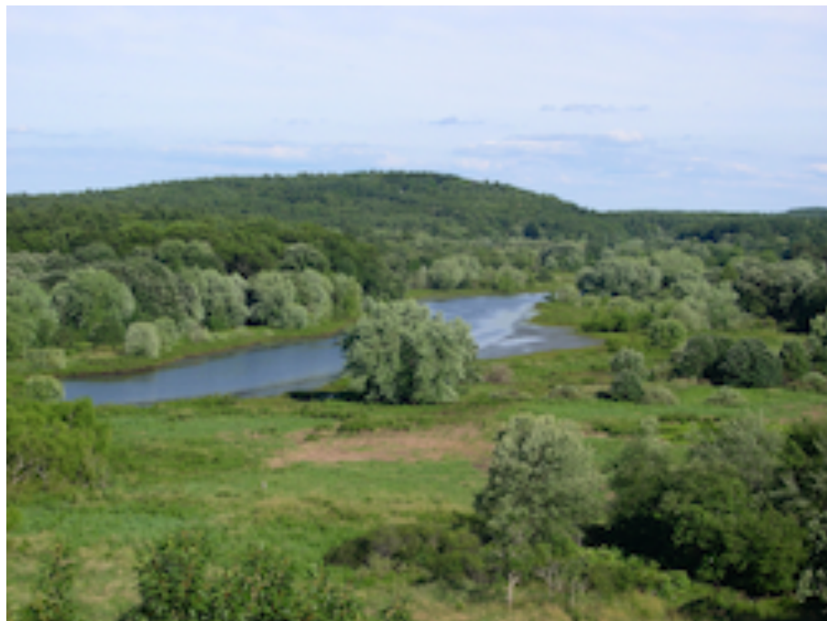
July 2, 2005—Summer (low water)